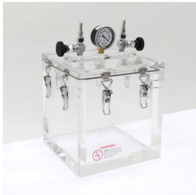
Figure 1. Acrylic vacuum chamber

If feed-throughs for wiring or electrodes are needed, aluminum is easier to machine and modify for these applications. Acrylic is more prone to cracking, which may develop into leaks over time.