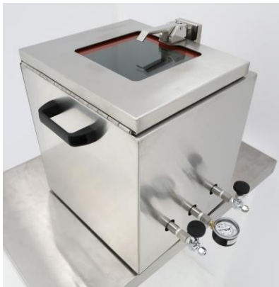
Figure 3. Stainless steel vacuum chamber

The 8" by 8" window offers a view of the materials inside and is made of heat-resistant safety glass. Handles are installed on the sides of the chamber for easy transport. The silicone gasket ensures a tight seal and provides excellent chemical resistance.