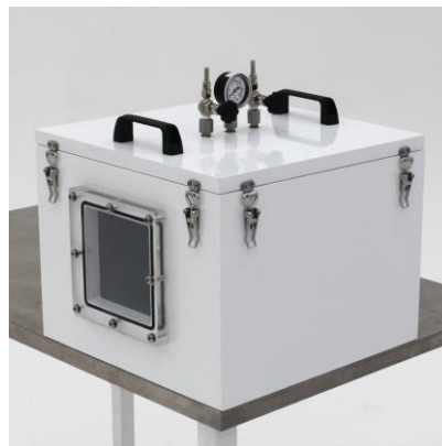
Figure 2. Aluminum vacuum chamber