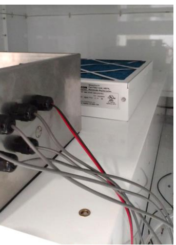
Figure 7. The blue MERV 7 pre-filter can be lifted out and replaced with a new one