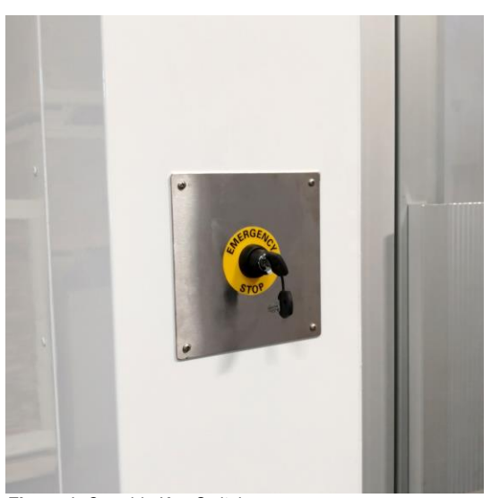
Figure 1. Override Key-Switch

The TUI logo should glow solid, indicating that the unit is ready for use. If the TUI logo does not light up, the unit is not receiving power. Check the power source for any malfunctioning; if the problem persists, check the circuit breakers and fuses inside the unit's electrical box (See Section 5.2 for access instructions).