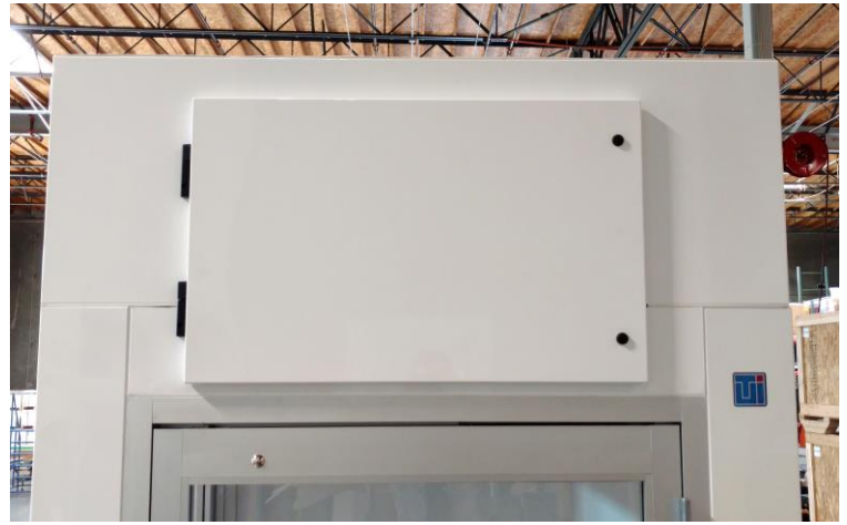
Figure 6. Open the front access door of the upper housing by quarter-turning the cam latches with a flat screwdriver