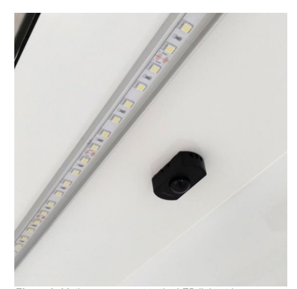
Figure 3. Motion sensor next to the LED light strip

The external air fitting (shown in Figure 4 ) is a reference point and should not be obstructed or used for any other purpose.