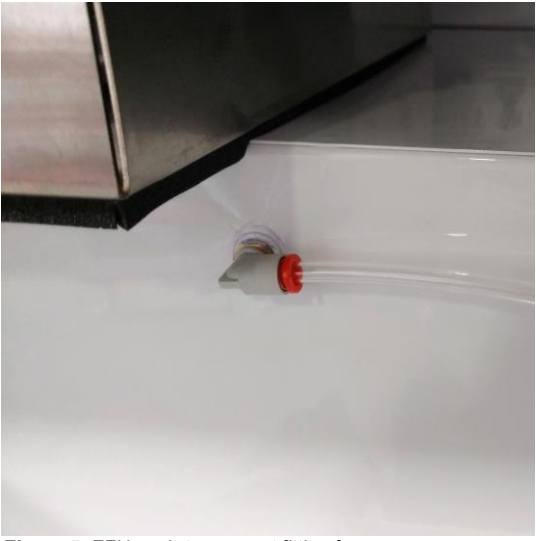
Figure 5. FFU push-to-connect fitting for pressure gauge

Users will have to manually reassess HEPA filter saturation periodically or determine an appropriate filter replacement timeline.