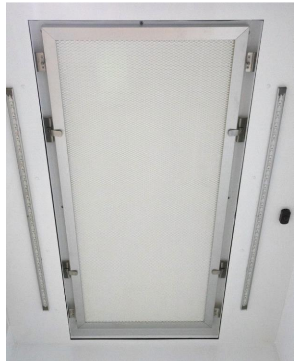
Figure 8. HEPA filter visible after removing stainless steel screen

See Section 6.0 for replacement filter part number.