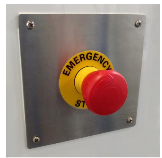
Figure 2. Emergency Stop Button (twist to reset)